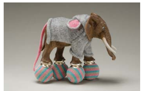
Felieke van der Leest - Norway Elephant Pastello di Bello