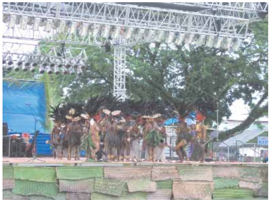
Papua New Guinean performers at the Festival of Pacific Arts, Palau, 2004