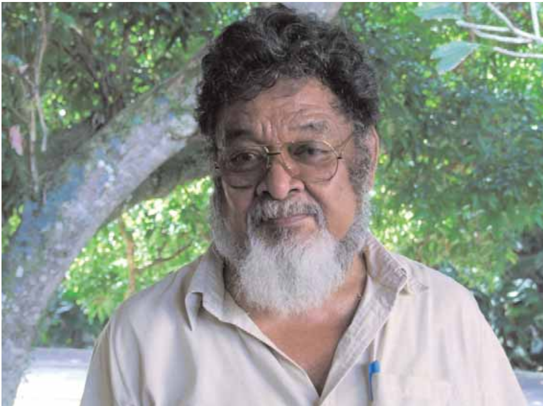
Epeli Hau'ofa, Director of the Oceania Centre for Arts and Culture, University of the South Pacific, Fiji

The Festival of Pacific Arts / The first South Pacific Festival of Arts, held in Suva, Fiji, in 1972, provided an arena for the disconnected and marginalised efforts of dance practitioners throughout the Pacific to find strength in a collective vision. This was the first regional event that gave Pacific Islanders the confidence they needed to continue practising, teaching and performing their dances and other art forms. Although its name has changed to the Festival of Pacific Arts, its original mandate has remained largely unchanged. It continues to be the premiere festival in the Pacific region for the promotion and perpetuation of traditional Pacific dances.