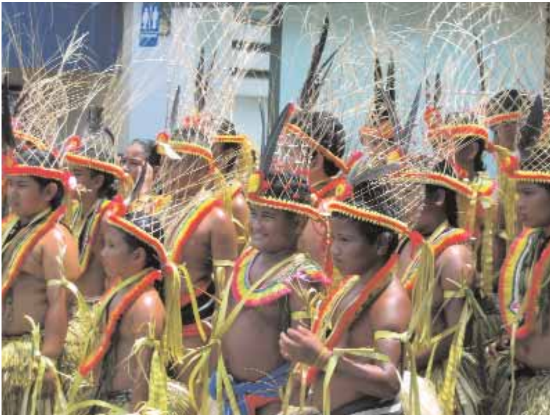
Micronesian dancers at the Festival of Pacific Arts, Palau, 2004

An advantage of having so many groups perform dances that ranged from traditional to contemporary to hip-hop is that the best dancers and the best dance groups become evident. Pacific audiences are not shy to express their emotions, particularly when watching their own people on stage. When there is little applause or clapping, no shouts or shrieks of delight, it means we are not impressed. The reverse means we are having a great time being entertained, and we are appreciative of the hard work that went into preparation. At Te Papa, audience reactions varied, acting as a barometer on the quality of the performers on stage. Some groups were better prepared than others; some better costumed; others better choreographed. As a dance ensemble, the Oceania Dance Theatre best