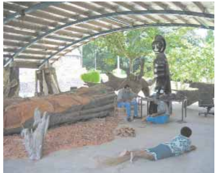
Sculptor working at the Oceania Centre for Arts and Culture, University of the South Pacific, Fiji