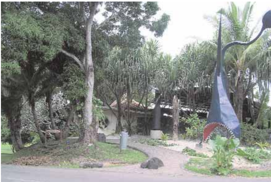
Oceania Centre for Arts and Culture, University of the South Pacific, Fiji, 2005