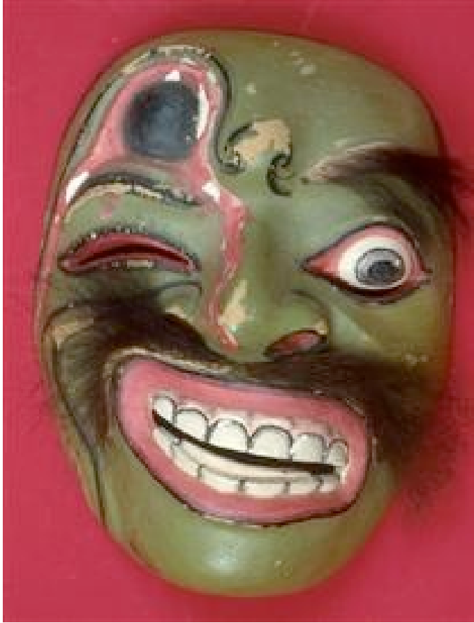
Mask from the Eastward Bound exhibit on the Tropenmuseum website.

who are passionate about music. All interviews are in English. The New Music From Indonesia site is highly recommended to anyone interested in music and contemporary Indonesia. Its interviewees are creating, as the title indicates, the new music of Indonesia.