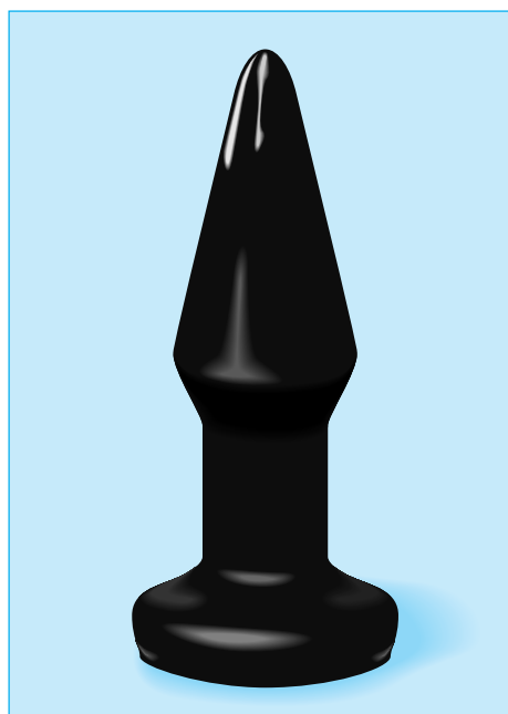
A self retaining "butt plug," which can be used in anal dilatation exercises or simply as a sex toy