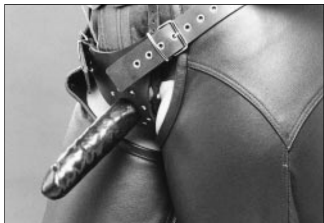
Lesbians may choose to be a “penetrator” in lovemaking by using a dildo and harness or other sex toys