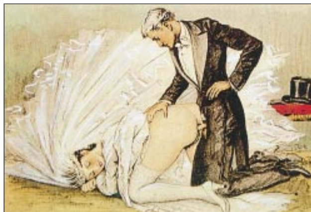
In absolute numbers there are more heterosexuals having anal sex in Britain than there are gay men. (Illustration (possibly by Paul-Emile Bécot) for An Up-to-date Young Lady (1920s) by Helena Varley)