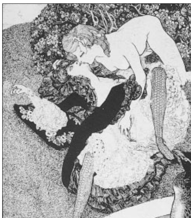
Mutual masturbation, oral sex, caressing, and penetration with fingers or sex toys can be considered as core activities of lesbian sex. ("Anything is possible!" from La Grenouillère (1907) by Franz von Bayros)