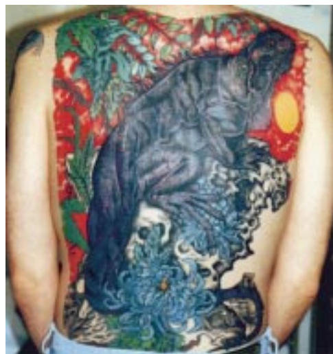
Figure 1 Patient's back with completed tattoo.

Body piercing and tattooing are becoming increasingly fashionable and socially accept-