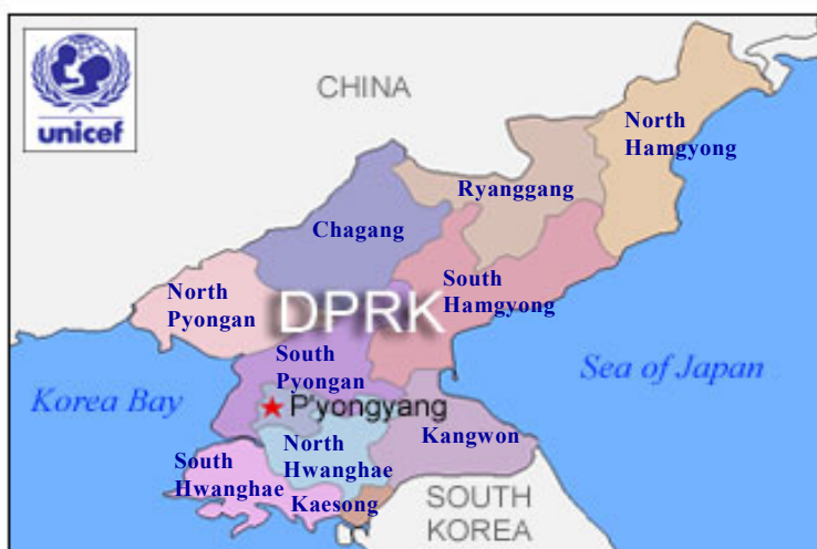
The boundaries and names shown do not imply official UN endorsement.

The same issue is now permanently on the agenda of all north-south meetings. This has changed the atmosphere of the exchanges, which had been very positive following the inauguration of South Korean President Roh Moo Hyun in February. Nevertheless, inter-Korean projects do still seem to be progressing. The latest economic cooperation meeting between the North and the South, held in Pyongyang in May, continued moves to relink roads and railways, open an industrial zone in Kaesong, just north of the truce line, and resume tourism from South Korea to Mount Kumgang in the North. The Republic of Korea also agreed to provide 400,000MT of rice as humanitarian assistance.