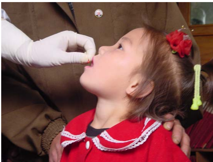
A girl receives vitamin A at a ri hospital in Huichon City, Chagang Province

The first national child health day for 2003 was held on May 20. On that day, around 2 million children received a dose of vitamin A (children 6 months to 5 years of age) as well as deworming medicine (2 years to 5 years of age). The final number of children reached is still being tallied but it is again expected that over 95% of children will have been reached in all villages countrywide. As usual, UNICEF and the Ministry of Public Health (MoPH) organized field visits for partner agencies and representatives of resident donor missions to observe child health day activities. A second national day is planned for November 20. Vitamin A supplements boost children's immunity, helping to protect them from illness and increasing their survival. The DPRK has a very successful vitamin A supplementation programme with the two national health days each year regularly achieving the highest vitamin A coverage of all countries in the region. This high coverage was confirmed by the recent nutrition assessment in ten provinces / cities. The same assessment showed that only around 30 per cent of women receive vitamin A supplements after delivery and a priority for this year is for all women to receive vitamin A soon after delivery, thereby ensuring adequate intake of vitamin A, through breast milk, throughout the first six months of every child's life.