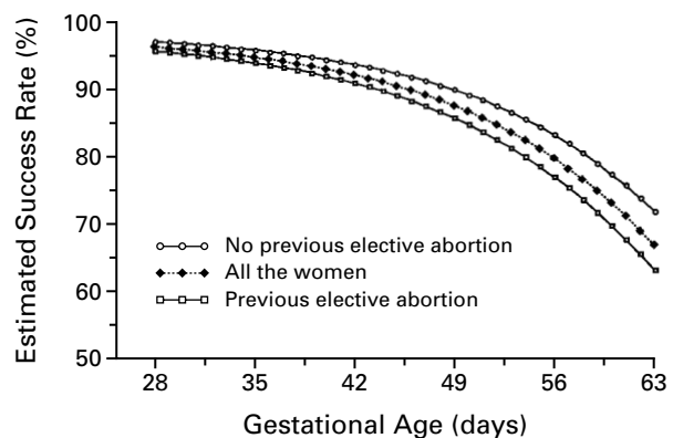
Figure 1. Logistic-Regression Analysis of the Predicted Probability of Successful Pregnancy Termination, According to the Duration of Pregnancy for All the Women and for the Women Who Had and Those Who Had Not Had Previous Elective Abortions.

Excessive bleeding necessitated blood transfusions in four women and accounted for 25 of 27 hospitalizations (including emergency-room visits), 56 of 59 surgical interventions, and 22 of 49 administrations of intravenous fluid. Hospitalizations, surgical inter-