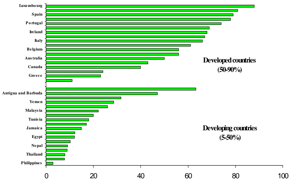
Figure 1: Public spending as % of total spending on pharmaceuticals in selected countries