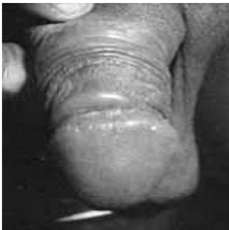
Figure 1 Mondor's disease of penis presenting as a firm, cord-like lesion of the coronal sulcus

Penile Mondor's disease is a benign pathology of the superficial dorsal penile vein affecting sexually active men. 2 In this study most of the subjects were young and under 45 years of age. Although lesions are classically asymptomatic, some patients have pain or discomfort, especially on erection. 5–6 The majority of our patients were asymptomatic and only one third presented with mild to moderate pain and tenderness