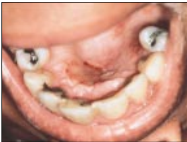
Herpes simplex ulceration