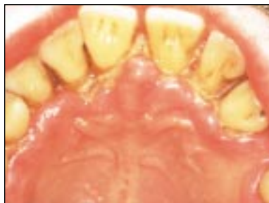
Necrotizing ulcerative periodontitis