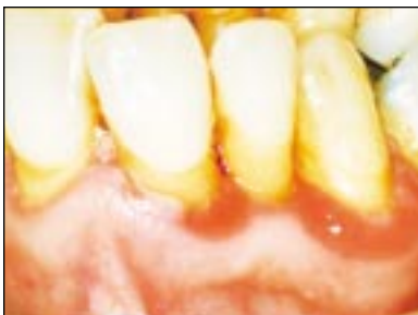
Linear gingival erythema