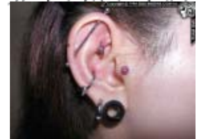
This person has 2 orbital piercings, 1 tragus, 1 industrial, a regular piercing, and an earlet.