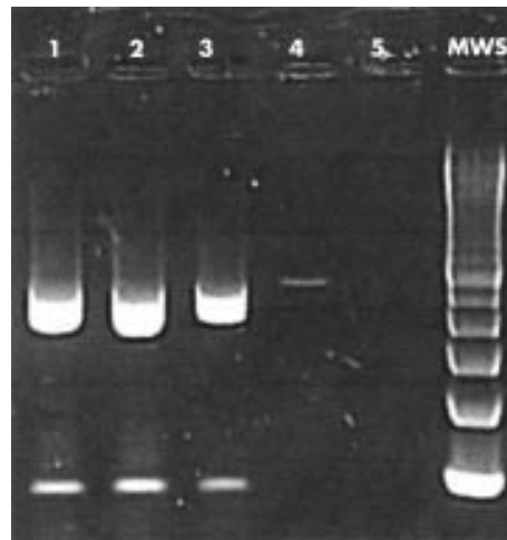
Figure 2 Gel electrophoresis showing characteristic banding patterns of HSV-1 and HSV-2. PCR products are digested as described in Methods. As HSV-1 contains the specific restriction enzyme site but HSV-2 does not, only HSV-1 is digested into two bands. The lengths of the two bands add up to the overall length of the uncut product. The upper band appears brighter, despite being equimolar with the lower, because it is much longer; consequently, more fluorescent dye intercalates into the DNA.

PCR is a well characterised method for rapid and sensitive diagnosis of HSV but, largely because of its cost and the