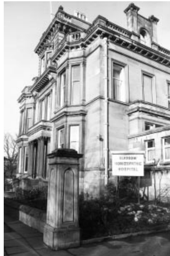
The old Glasgow Homoeopathic Hospital

We saw a wide range of medical problems but in the early 1950s we had only Sulphonamides and Penicillin plus mercurials for