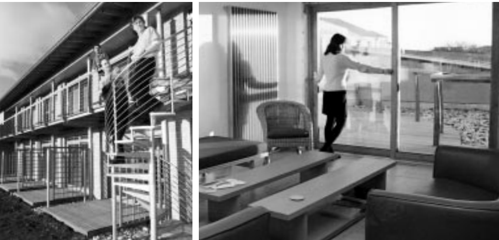
Views of the new Glasgow Homoeopathic Hospital

When David Reilly took over he brought tremendous drive and ideas for fund raising plus architectural and art design and at last an attractive new hospital and garden has arisen in Gartnavel Grounds not far from the original site suggested all these years ago.