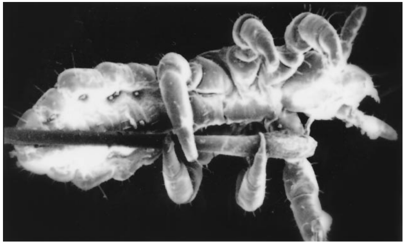
Fig 1. An untreated head louse standing on a hair (from Speare et al, 33 with permission). (Magnification: \times 37.5 .)