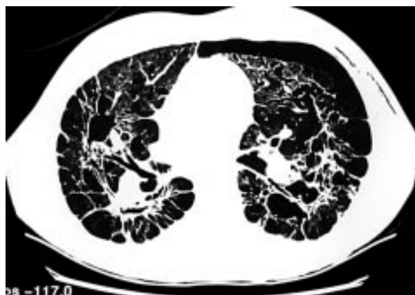
Figure 2 CT scan showing an anterior pneumothorax.