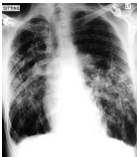
Figure 1 Chest radiograph consistent with underlying histiocytosis X but no obvious pneumothorax.

A search of the literature was undertaken using occult pneumothorax and its associations—that is, "OCCULT".mp.OR "VENTRAL".mp. OR "SUPINE".mp. OR "LOCALISED".mp. OR "LOCALIZED".mp. OR "DIFFICULT"..mp. OR "HIDDEN".mp. AND PNEUMOTHORAX/ or "PNEUMOTHORAX".mp.and "TENSION".mp. The limits to human and english language were applied. The search was performed using: