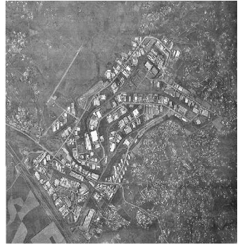
Figure 4. 1999.

Isithebe Industrial Park and Informal Settlement. Between 1989 and 1999, in particular, the informal settlement surrounding the park grew tremendously, despite the shedding of thousands of jobs.