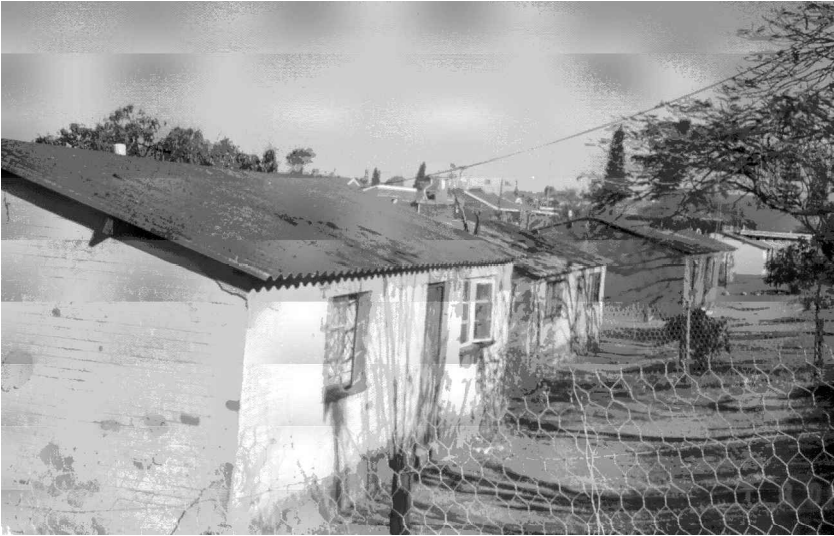
Figure 6. “Matchbox” houses in Sundumbili that were secured through men’s employment in one of the large factories such as SAPPI.