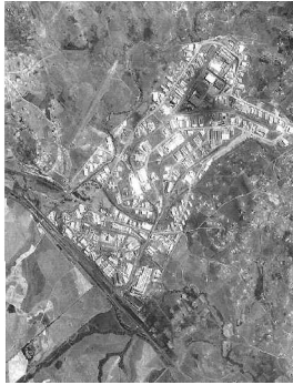
Figure 3. 1989.