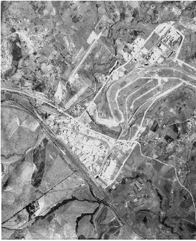
Figure 2. 1981.