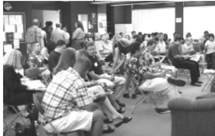
Candidates in the MAcc and MBA programs attend a graduate orientation to learn more about their programs.

They have also met with UH community college students planning to transfer to UH Mānoa. Selected honor students recommended by faculty on other UH campuses were interviewed as possible candidates to receive scholarships. Qualified honor students will be offered half-tuition scholarships for their first year at the University of Hawai'i at Mānoa's School of Accountancy with the understanding that the students will choose accounting as their major at UHM.