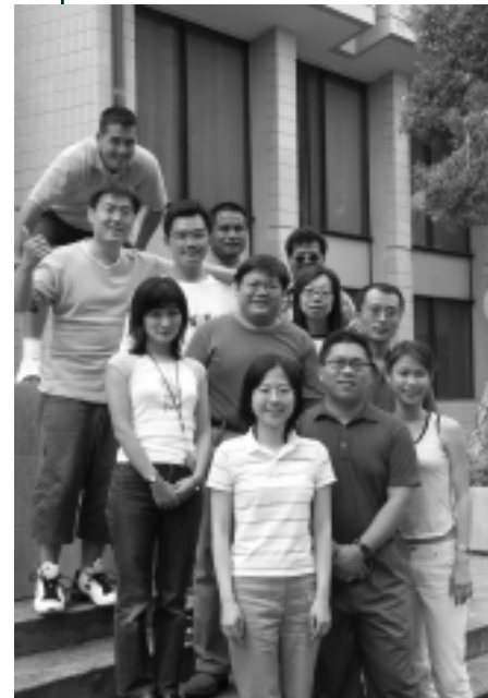
Participants from the Executive Accounting Program

Upon completion of the program, students are required to take an additional nine graduate courses (27 credits) with regular students in the MAcc Program to earn a master's degree in accounting. Students have up to five years to complete their MAcc course requirements. However, under normal circumstances, students should be able to finish the additional 27 credits in two semesters or two semesters plus a summer session. For more information visit: www.hawaii.edu/soa/executive.html .