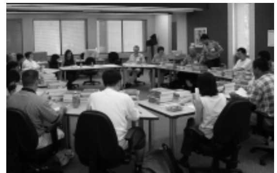
Accounting professors and professionals meet to discuss the School of Accountancy's program initiatives and renovation plans.

The SOA continues to attend Hawai'i's professional meetings such as the Hawai'i Board of Accountancy's to receive feedback from professionals on new developments in the accounting field.