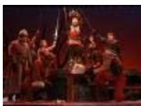
University of Hawaii also

Degrees offered include a BA in theatre and MFAs in directing, design, playwrighting, Asian performance and youth theatre, in addition to Ph.D.s in Western Theatre and Asian Theatre.