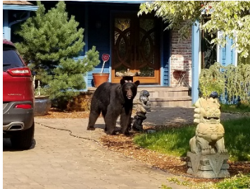
Figure 2: A new neighbor comes to visit