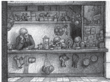
Illustration from The Invention of Hugo Cabret copyright©2007 by Brian Selznick. Reproduced by permission of the artist.