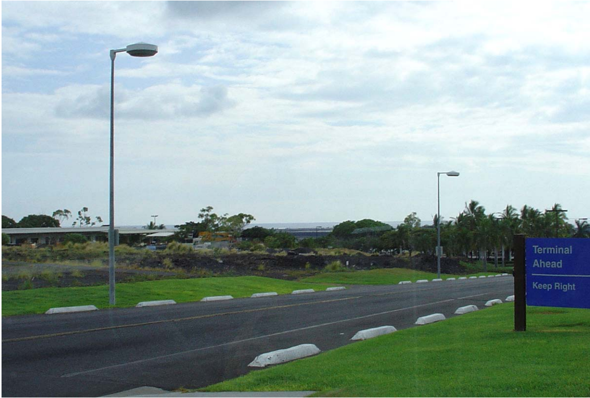
High-pressure sodium lamps along the access road to the Kona airport. The Hawaii county lighting ordinance requires use of low-pressure sodium lamps on roadways.