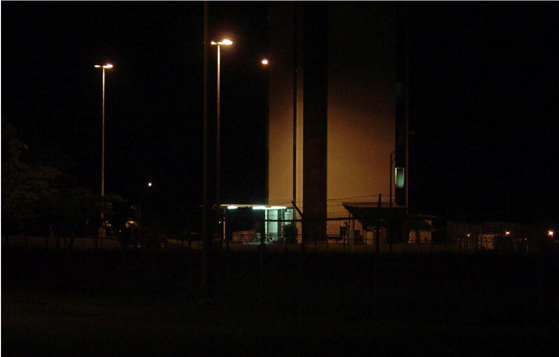
Lighting around the control tower at Hilo airport uses high-pressure sodium lamps. The Hawaii county ordinance requires that low-pressure sodium lamps be used on roadways.