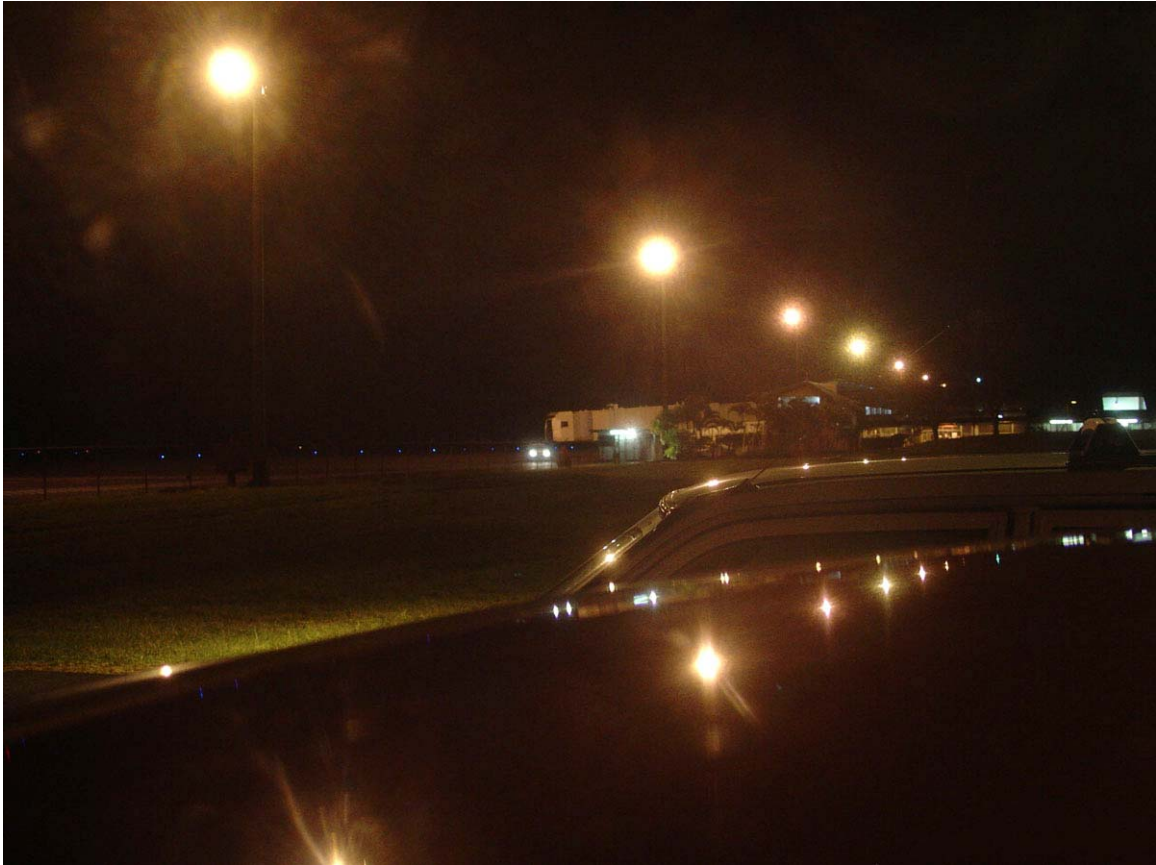
Ramp lighting at Hilo airport. These lights should be fully shielded to conform to the Hawaii county ordinance. They are not properly shielded.

Appendix — photographs of lighting at the airports on the Island of Hawaii. These photographs are included to demonstrate that the airport lighting on the Island of Hawaii does not conform to the Hawaii county lighting ordinance.