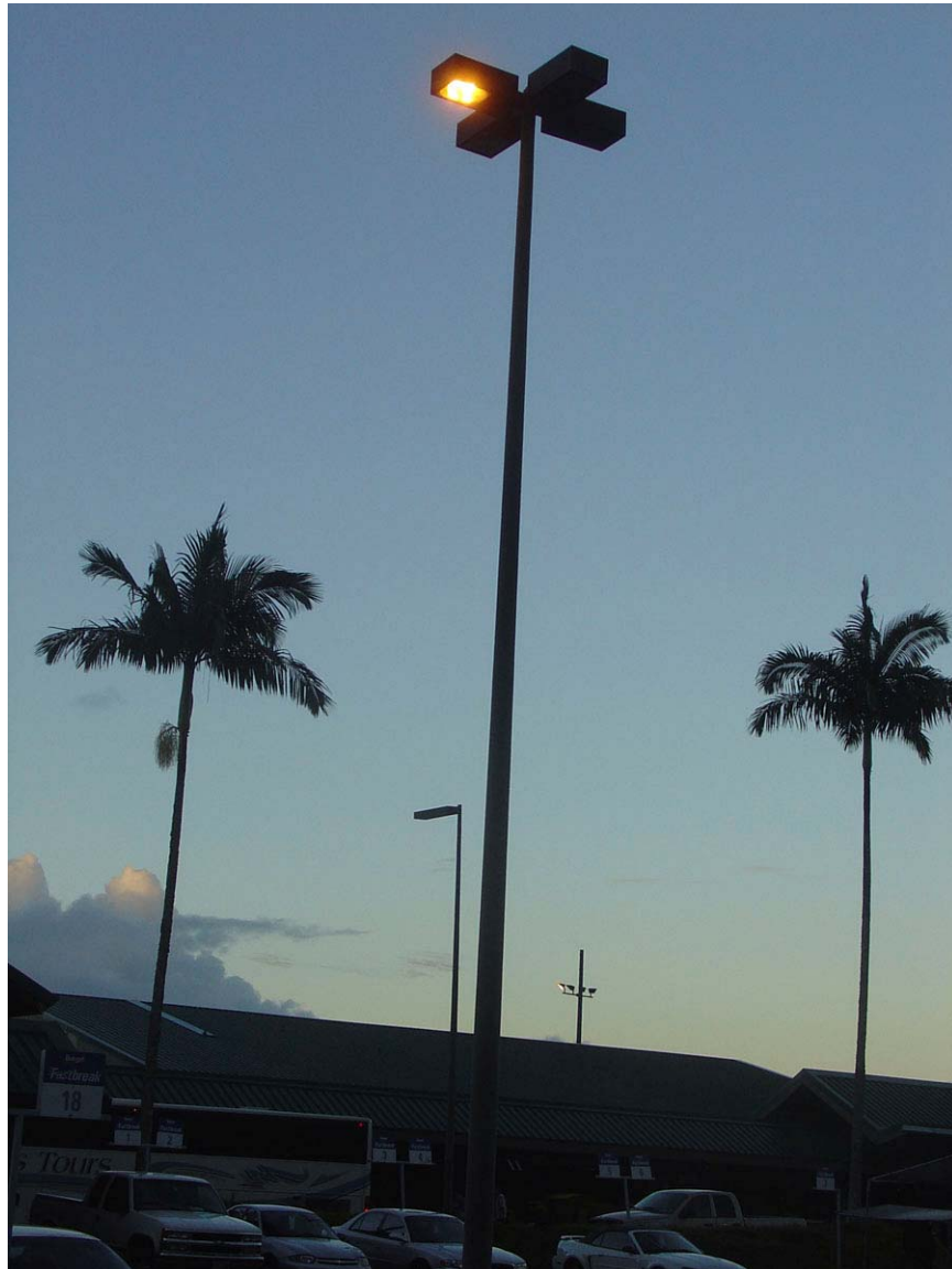
Newly installed parking lot lighting in Hilo airport. These lights are high-pressure sodium lamps. The Hawaii county ordinance requires parking lots to be lit using low-pressure sodium lamps.