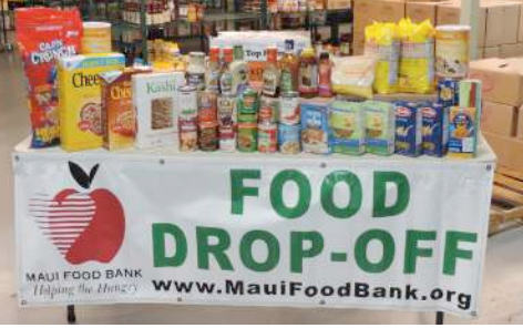
Food Drop-Off Banner (6'x2')