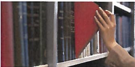
Higher Education Leadership Programs