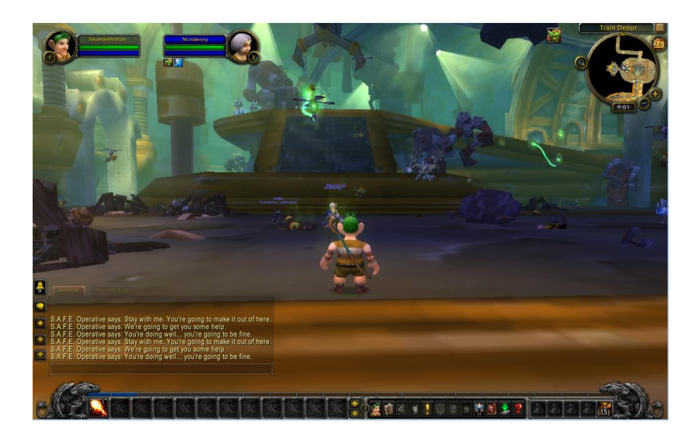
Figure 2. The Interface of WOW

This study was primarily conducted within the game environment of World of Warcraft ( WOW ). As of the time of writing this paper, WOW was the most popular MMOG in the world (Activision Blizzard, 2014), with 7.8 million subscribers logging in to the game from around the world. Developed and maintained by Blizzard Entertainment, WOW is a typical exemplar of the MMOG genre. It is a commercial game that requires not only a purchase of the game software, but also a monthly subscription fee in order to continue play. Given the short-term nature of this study I was able to utilize a free trial version of the game. There are limitations to using free trials however, which I will address later.