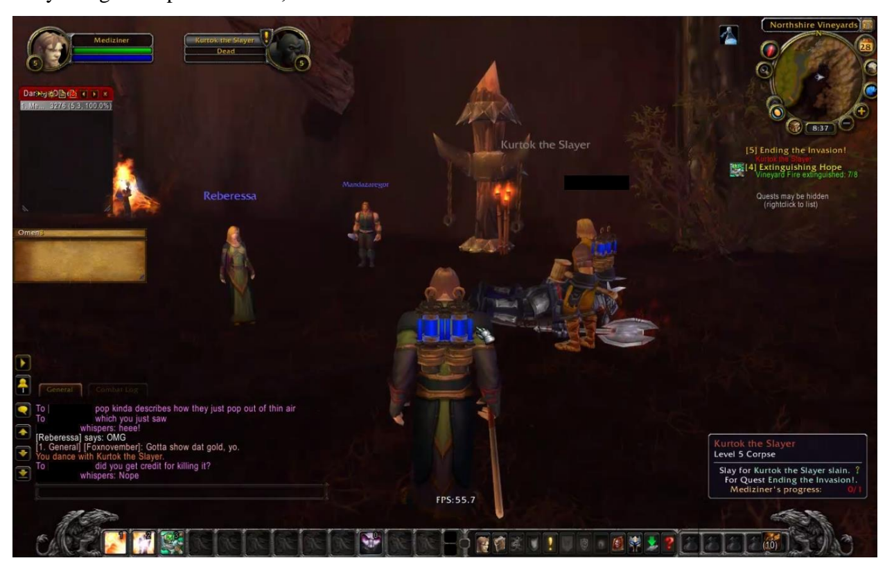
Figure 5. Waiting for the Enemy NPC to "Repop"

I were fast enough to target it and we are made to wait a while longer for the next repop. I pointed this out to Conan in line 3, which led to an immediate questioning in line 4 by Conan. In line 5, I recasted the word by providing a synonym, which Conan confirmed his understanding of in line 6. In this case, naruhodoo is a Japanese word which roughly translates as "I see." I gave further explanation of the word in lines 7 and 8, and Conan again displayed that he understood in line 9 by using the Japanese heee! , which in this context I would translate as "Woooow!".