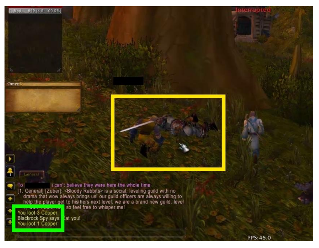
Figure 4. The Yellow Box Shows Conan Looting; the Green Shows Where the Word "Loot" Appears

This excerpt begins with both players killing enemy NPCs to fulfill a quest objective. After defeating an enemy, it is possible to check its corpse for items, what the game terms 'looting'. Conan is seen to be looting a felled enemy in line 1. Whenever the items are taken from a corpse, the text log indicates that players 'loot' something. In the case of line 3, it's one copper piece. Conan is seeing the same thing appear on his screen, because he asks in lines 2 and 4 what loot means. I explained in lines 8 and 9, with Conan confirming his understanding in line 10. In line 11 he then checked to see if this use of the word is limited to the game world. I elaborated on the meaning of the word and linked it to a real world context in lines 13 through 15. Conan appeared to really grasp this extension of the word's meaning in lines 16, 18, and 19.