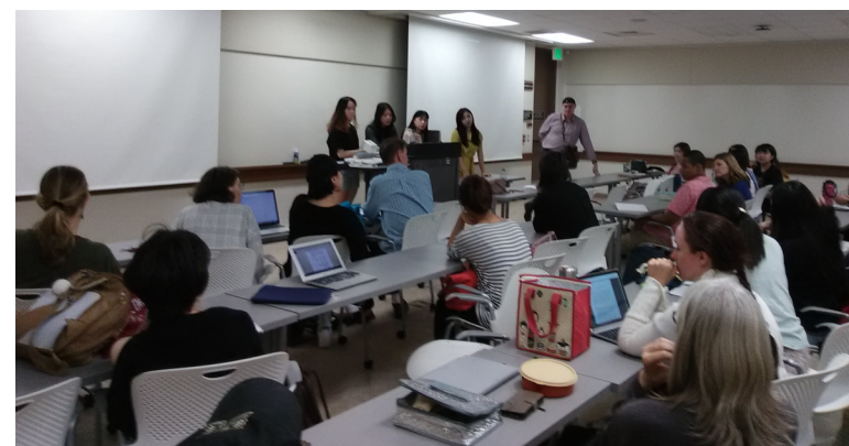
The TESLERS' presentation was followed by a panel discussion in which they shared key issues surrounding EFL education in Korea.

SLS thanks the TESLERS for sharing their experience and knowledge with us. Their Brown Bag involved an engaging discussion among students, faculty, and presenters.