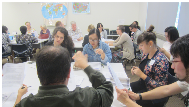
HI-TESOL attendees participate in a reading Workshop