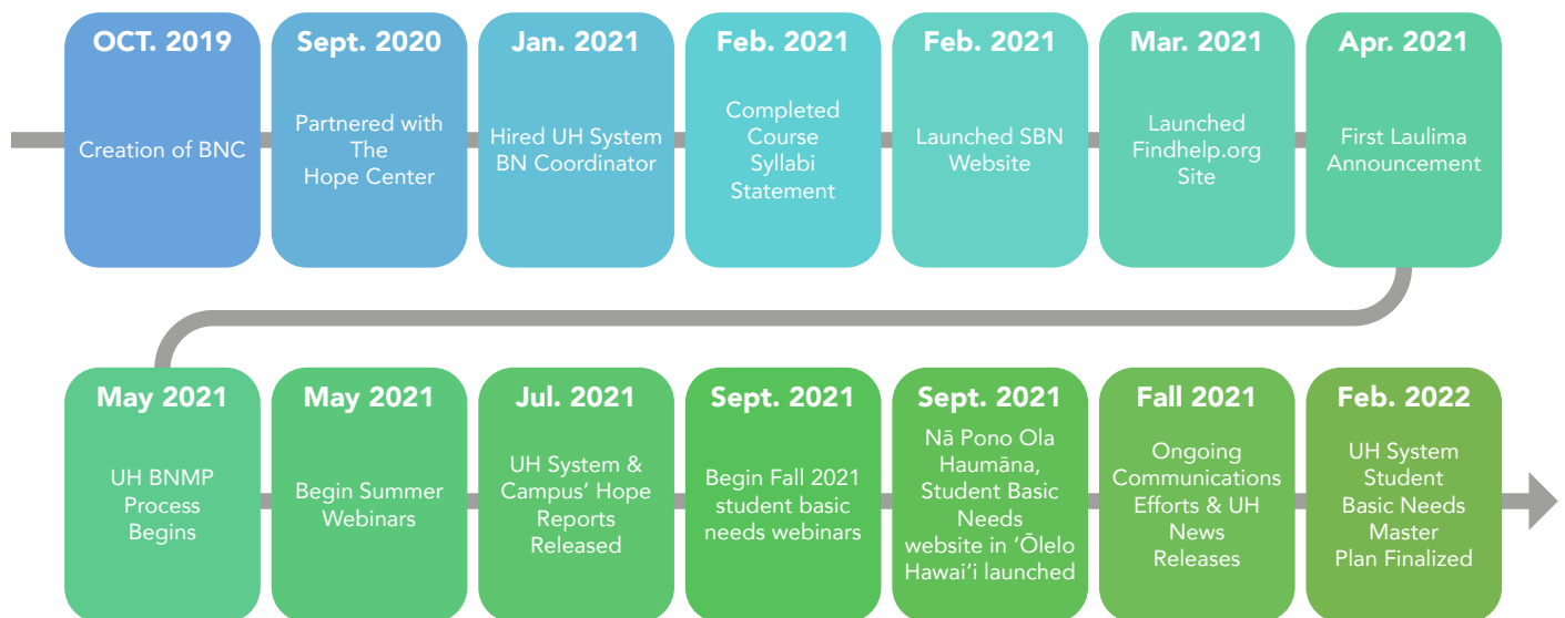
Image: Timeline of UHSBNC Key Activities (2019-2022)

Since its founding in 2019, the UHSBNC has defined and executed on the following basic needs priorities: